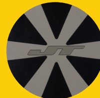
BLACK / BLACK