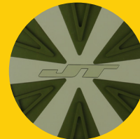
OLIVE / BLACK