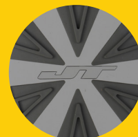
GREY / BLACK