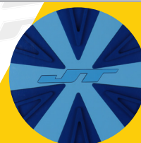
BLUE / BLACK